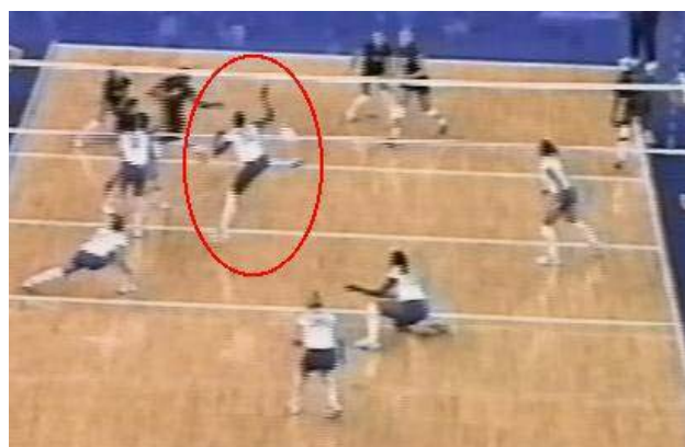
Figure 3. Unilateral landing resulting in the “position of no return.”

Interestingly, the majority of unilateral landings resulting from offensive jumps take place with the left leg and the majority of unilateral landings resulting from defensive jumps are performed with the right leg. This result may be related to the fact that the majority of the population (volleyball players included) is right handed. For example, when a right-handed player spikes the ball, their goal is to reach as high as possible with the right hand in order to hit the ball down. As a result, the trunk is flexed to the left. This lateral flexion raises the right side of the body and can lead to a left foot first contact upon landing. The relatively high number of right foot first contacts by defensive players could be in response to defending right-handed spikers. Handedness and arm swing activity were not recorded for the present study, but should be addressed in future research.