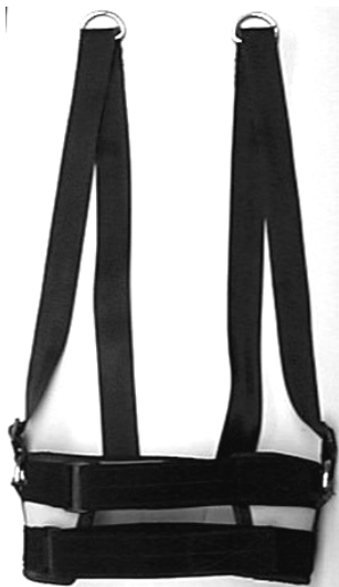
Figure 1. Z-Lift treadmill harness.

A Woodway Desmo S TreadErgometer treadmill, a Pneumex lift system, and Z-lift suspension harness (Z-lift Corporation, Austin, TX) were used in this study. The subjects were fitted to a Z-lift harness (Figure 1) that was attached to the Pneumex lift system which lifted each subject by a percentage of body weight (Figure 2).