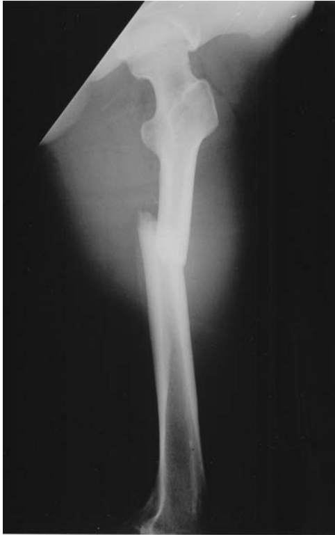
Figure 2. Plain radiograph on admission showed a displaced fracture of the left femur.

radiograph revealed a displaced fracture of the left femur (Figure 2). Neither periosteal reaction nor osteoblastic nor osteolytic change was apparent. On