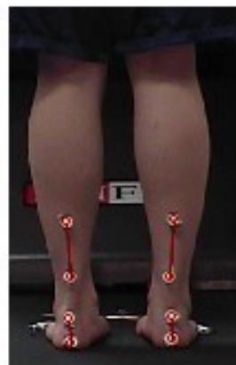
Figure 1. Barefoot rearface angle measurement.

videod with the subject in the static standing position (see Figure 1).