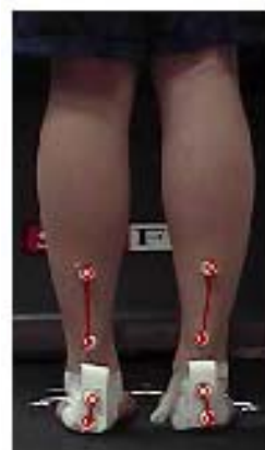
Figure 2. Barefoot with mold rearfoot angle measurement.

One of the primary limitations of studying rearfoot motion is the difficulty of measuring the movement of the foot inside of the shoe. If the calcaneal markers are placed over the heel counter of the shoe rather than the calcaneus the recorded movement is more representative of the movement of the shoe rather than the foot (Cornwall et al., 1995). A reliable method of quantifying calcaneal movement within the shoe has been devised by Polinsky (Genova and Gross, 2000). A calcaneal mold marker constructed of Orthoplast® was fashioned for each subject. The Orthoplast® was placed on the calcaneus and then extended posteriorly so that it would come out and over the heel counter of the shoe. The calcaneal mold was secured to the subject's heel with adhesive spray and tape. The previously placed calcaneal markers were transferred to the calcaneal mold (see Figure 2).