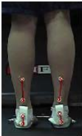
Figure 3. Orthotic rearfoot angle measurement.

measured with a goniometer and videoed for validation. Subjects then stood on their orthotics in the static standing position and the calcaneal angle was measured with the goniometer and videoed (see Figure 3). Subjects were asked to put on their shoes and assume the static standing position (see Figure 4). The calcaneal angle was measured with the goniometer and videoed for validation in the shod condition. Subjects then placed their orthotics in the shoes and stood in the static standing position while the calcaneal angle was measured with the goniometer and videoed. The entire data collection process took no longer than 10 minutes for each subject and the subject was allowed to take a break at any time. Also, the subject were not on their feet for more than 3 minutes at a time. Thus, it was felt that fatigue would not have an impact on the rearfoot angle measurements.