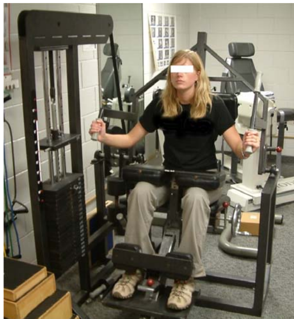
Figure 1. BackUP lumbar extension dynamometer.

The participants completed a 5-minute warm-up on a cycle ergometer (to reduce the risk of injury) prior to testing. Before positioning the participants in the BackUP dynamometer, the range of motion stop was set to 0° of lumbar flexion. Participants were then seated in a position where their feet were placed on a footrest with their lower legs against the shins pads and the knees and hips flexed to approximately 90°. Next, the lumbar support height was adjusted both horizontally and vertically to ensure a neutral position where the fulcrum point of the movement arm passed through the frontal plane of the back in line with the hip joints. The lumbar pad permitted the primary pressure to occur on the pelvis at or slightly above the posterior superior iliac spines, below the fifth lumbar vertebrae. The back pad height on the movement arm was adjusted where the pad was located in the middle region of the thoracic spine at the level of the shoulder blades. The thigh restraint was then set so that the pads were resting on the thighs. Finally, a hydraulic lever was engaged to raise the footrest (knees and hips remaining at 90°), which caused the femurs to be driven toward the pelvis, securing the pelvis against the lumbar support pad. All pelvic restraint settings were recorded for each individual, and the same positions were used on subsequent tests.