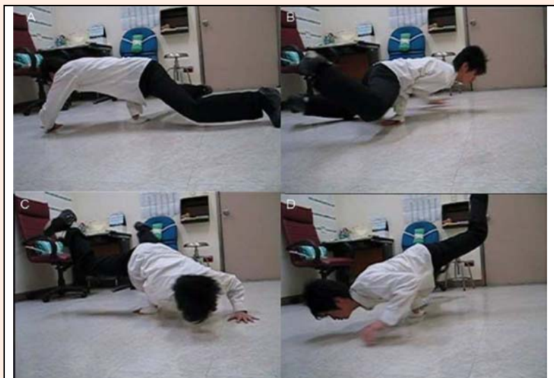
Figure 1. “HAND GLIDE” is a type of spin usually performed while balanced in a one-handed float position.

The clinical history and presentation were strongly suggestive of a stress fracture of the middle third of the ulnar shaft. The patient was advised to restrict both weight bearing and rotational physical activities of the right forearm. Follow-up radiographs after 3 months