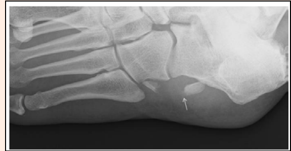
Figure 1. Radiograph of the foot. Fracture of the os peroneum was detected on oblique view.

pain of the lateral aspect of the left foot but he was able to walk and to bear weight with pain. He consulted a primary care doctor and was transferred to our hospital two weeks after injury. On physical examination, diffuse swelling and tenderness were detected on the lateral aspect of the left foot. There were no neurovascular complications of the foot and toes.