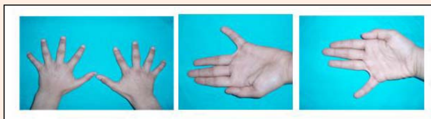
Figure 1. Bilateral little-finger distal interphalangeal joint flexion and valgus deformities.

A 14-year-old male high school student who had played volleyball for 3 years presented with a complaint of right- and left-hand little-finger flexion, valgus deformity (Figure 1), and pain. These symptoms began during his second season of competitive play. His role was a setter and passer on the team. The patient initially complained of pain in the distal phalanges of the little fingers, but he continued to play. As he continued to compete, he began to note the onset of flexion and a valgus deformity of the distal interphalangeal (DIP) joints. Plain radiographs and a hand examination were performed, and the flexion and valgus deformity were obvious on plain radiographs as well as on his clinic examination. A bilateral little-finger distal phalanx base epiphysis injury was seen. This injury is characterized by a biplanar Salter-Harris physal injury, type V on anteroposterior radiographs and type II on lateral plain radiographs (Figure 2). The wrist, hand, and other fingers were normal. As the pain persisted, he was provided with bilateral little-finger splints. Control plain radiographs were taken with finger splints and the patient was instructed to abstain from play until physal closure.