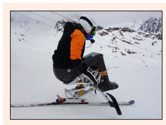
Figure 1. Paralympic Alpine Skiing sitting athlete in field measurement situation equipped with mobile metabolic analyzer.

The study was approved by the ethics committee of the local School of Medicine, and written informed consent was obtained from the athletes before commencing data collection.