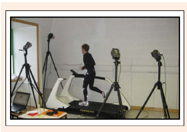
Figure 1. Treadmill, camera and marker experimental set up.

Participants ran for 5 minutes at a self-selected speed to warm up and familiarise themselves with the treadmill. Participants were then randomly assigned to undertake the barefoot or shod condition first in order to limit any potential order effects. Participants completed 2 minutes of running at 3.05 \text{ m}\cdot\text{s}^{-1} followed by a 2 minute rest period before undertaking 2 minutes of running at 4.72 \text{ m}\cdot\text{s}^{-1} . Following 2 minutes of stationary rest the same procedure was repeated for the remaining barefoot or shod condition. To standardise the shod condition all participants wore a neutral running shoe from a well-recognised manufacture (New Balance; MR350WR).