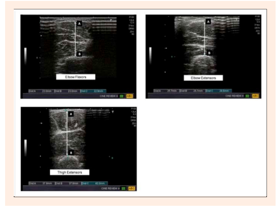
Figure 1. Typical example of ultrasound images obtained in three muscular sites. Panels A and B represent adipose/muscle interface and muscle/bone interface, respectively; arrow represents the measured thicknesses.

The cross-sectional images were frozen on the